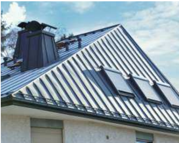
Building Rooftops Frames