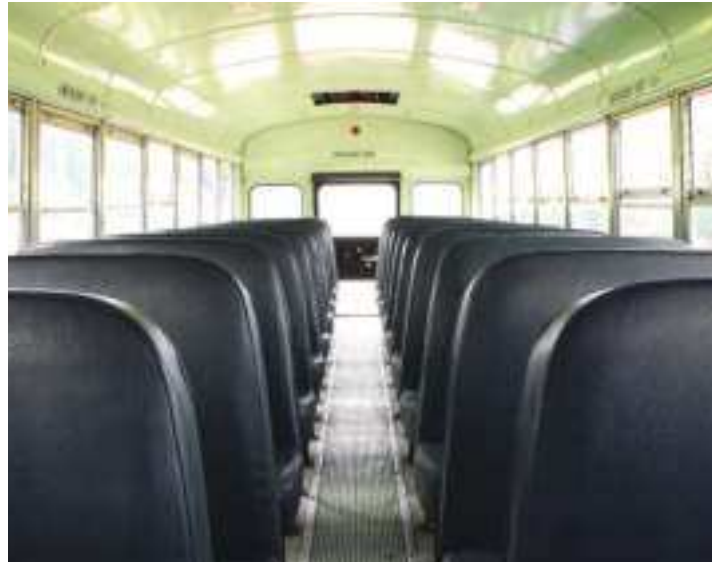
Bus Roofing and Automobile Parts