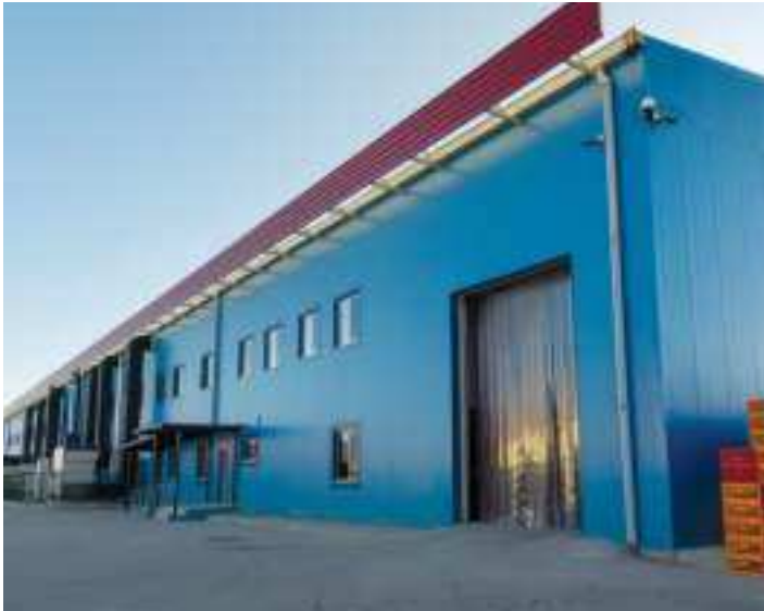
Water Gutters, Down Take Pipes