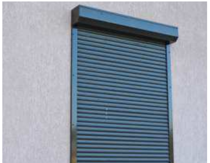
Colour Coated Shutter