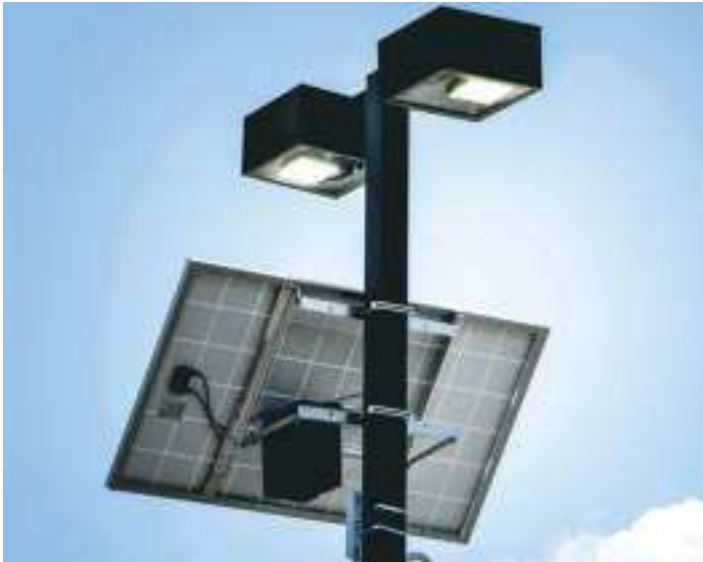
Solar Panel Pedestals